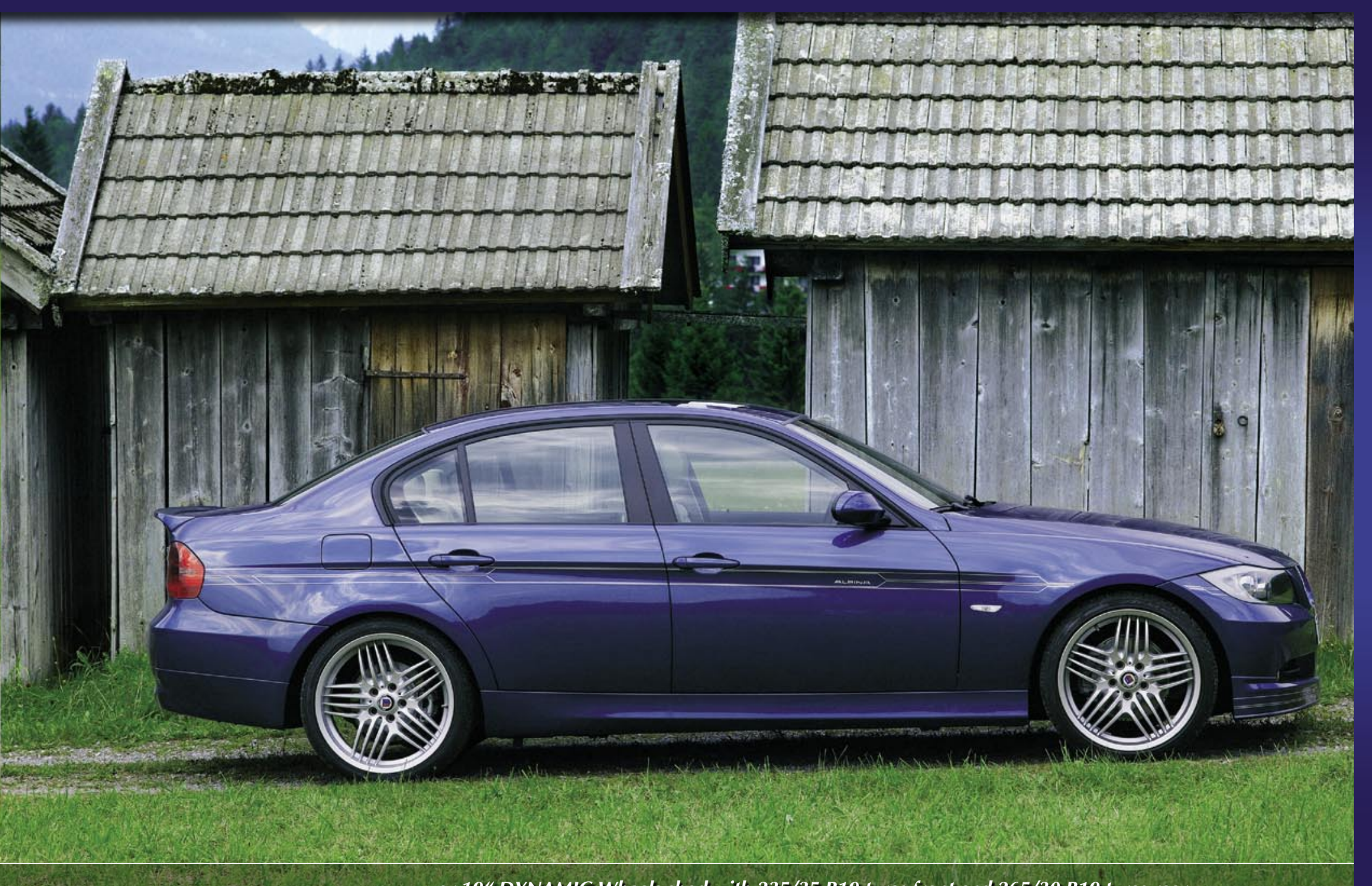
...or 19" DYNAMIC Wheels shod with 235/35 R19 tyres front and 265/30 R19 tyres rear