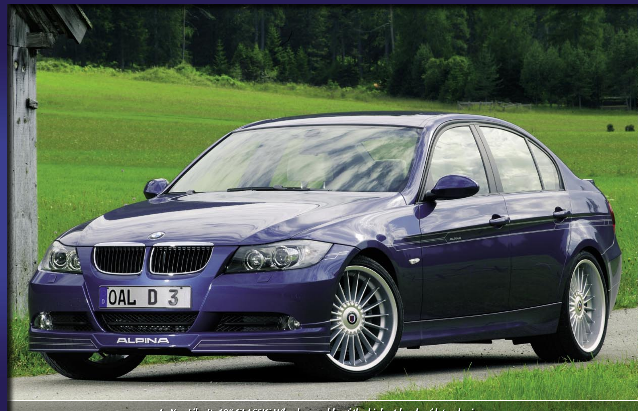
As You Like It: 19" CLASSIC Wheels, capable of the highest levels of lateral grip...