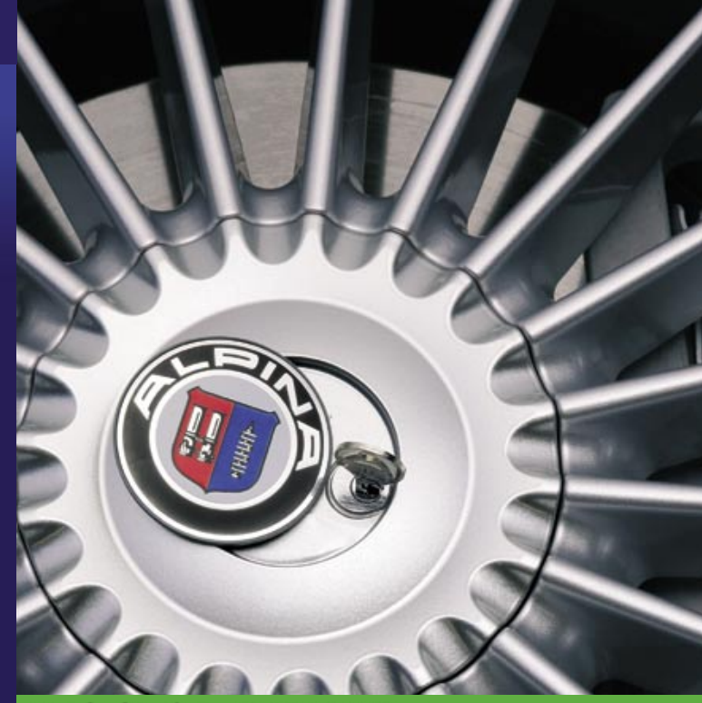
Standard Equipment 19" CLASSIC or DYNAMIC Wheels (CLASSIC shown here)

The Touring's light-footed, extremely agile handling is immediately noticeable, and previously not found in this form in a diesel. The secret lies in the ideal weight balance of 50/50 front to rear, in combination with it's neutral, supple suspension