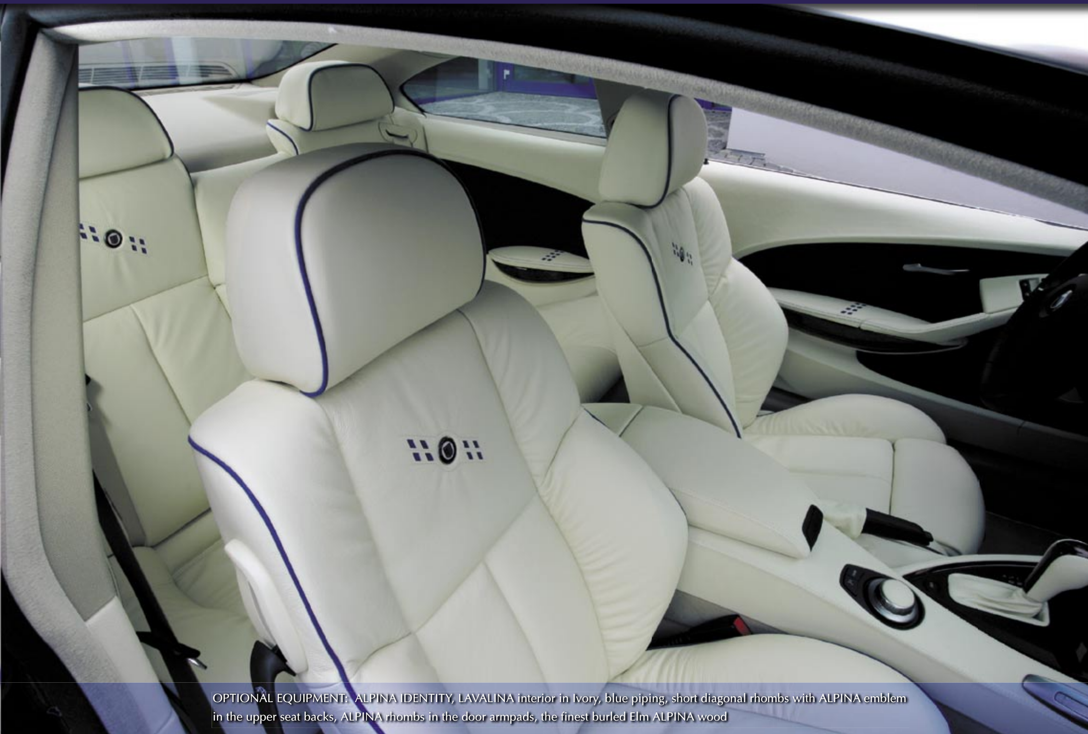
OPTIONAL EQUIPMENT: ALPINA IDENTITY, LAVALINA interior in Ivory, blue piping, short diagonal rhombs with ALPINA emblem in the upper seat backs, ALPINA rhombs in the door arm pads, the finest burled Elm ALPINA wood